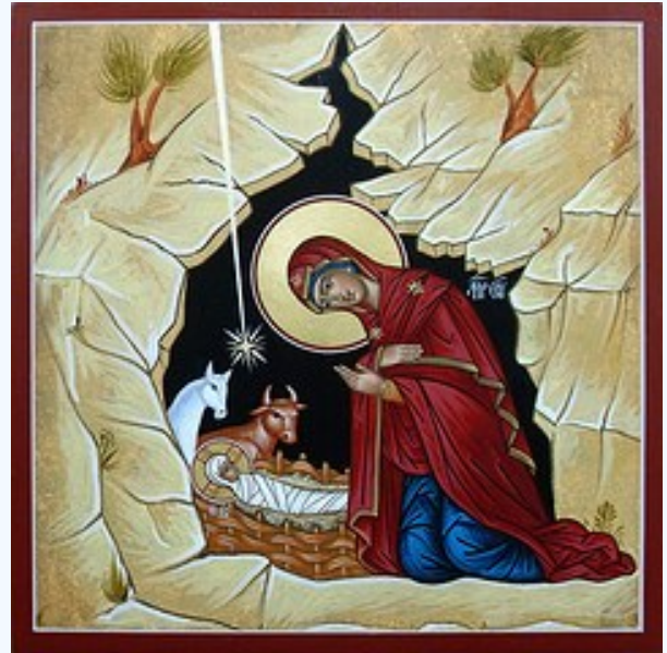
According to the forty-day tradition, the Phillip's fast in preparation for Christmas begins November 15. This is a good time to read the papal encyclical "The Light of Faith." Visit the Vatican website to download the document.

cannot be confounded, a love that does not pretend, and a wisdom that is complete. You have said, "Unless you become like children, you cannot enter the kingdom of heaven," grant that in this feast we may again experience the rebirth we were given in baptism, and sing out with the angels, "Glory to God in the highest, and peace on earth to those on whom his favor rests." You have humbled yourself, O Christ our God, may your name be exalted, together with the Name of your eternal Father and the Name of your all-holy, good and life-giving Spirit, now and ever and forever. Amen.