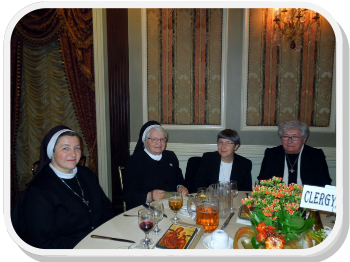
Sisters of St. Basil attend the Eparchy of Passaic's 50th Anniversary on Sunday, November 10.