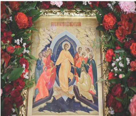
Feast of Faith 10.95 - 10 Cards