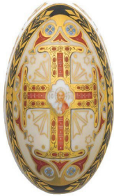
Paschal Egg $10.95 - 10 Cards